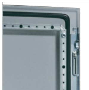
FERMAPOR K31 in electrical enclosures