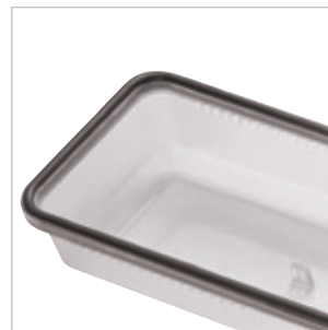
FERMAPOR K31 in lighting products