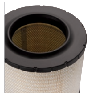
FERMAPOR K31 in filters