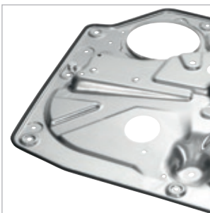
FERMAPOR K31 in automotive parts