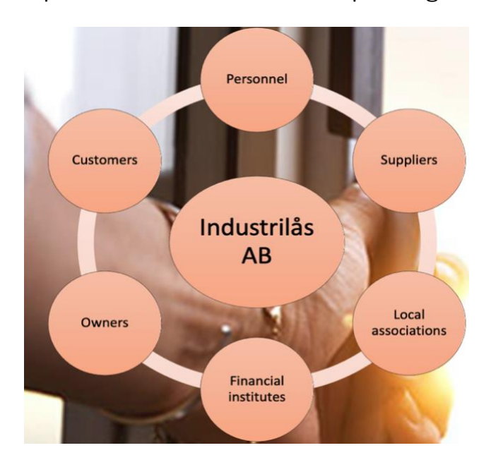
Figure 1 , Identified stakeholder categories who participated in the stakeholder dialogue.

72 answers were registered divided into 6 different stakeholder categories ( Figure 1 ) where a weighted average was used to be able to identify the highest prioritized sustainable development goals.